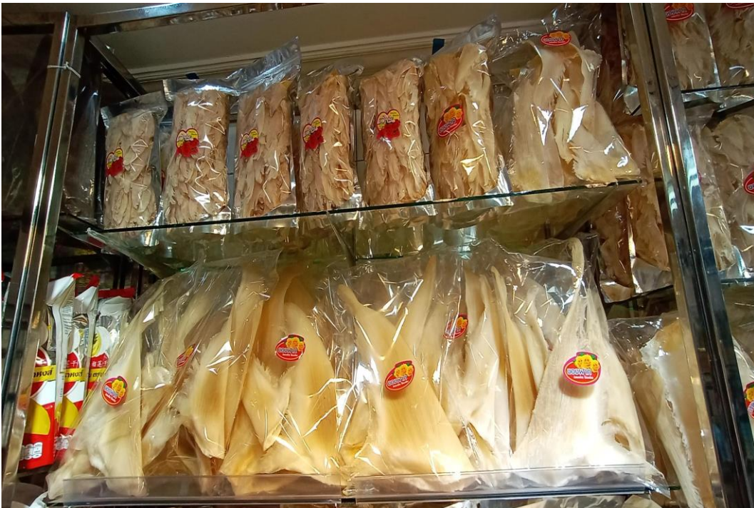
Dried shark fins