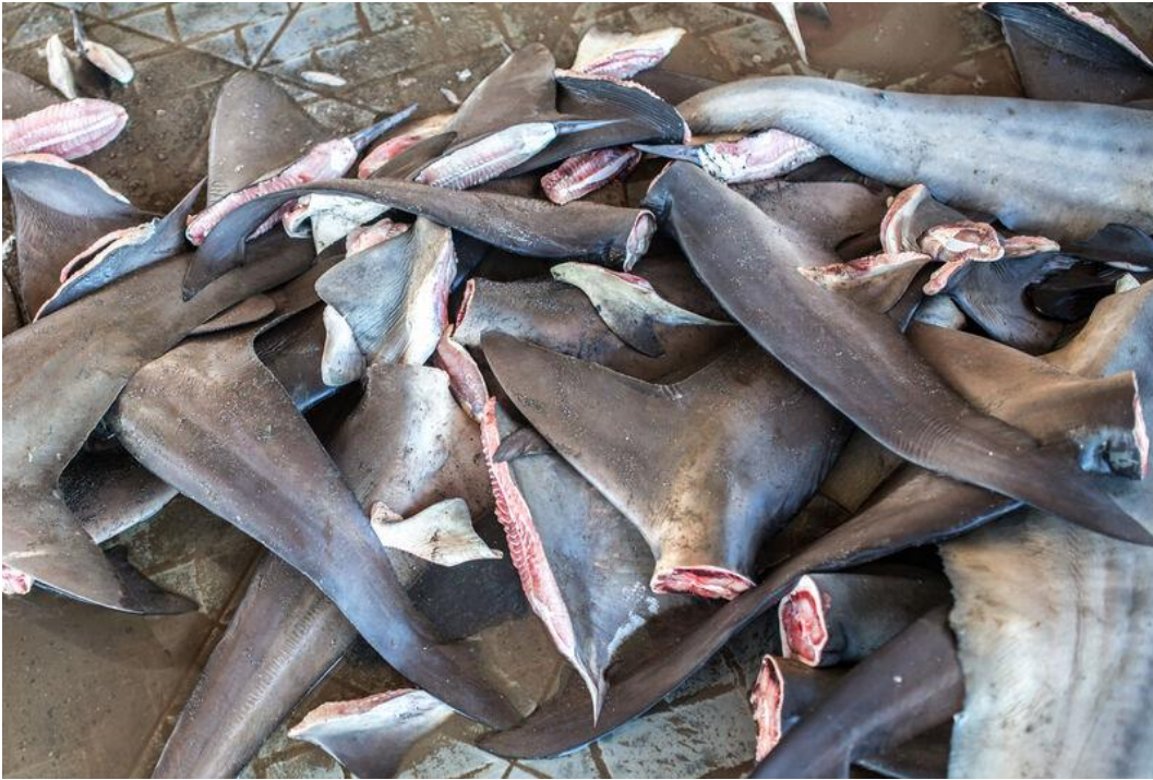
Shark fins